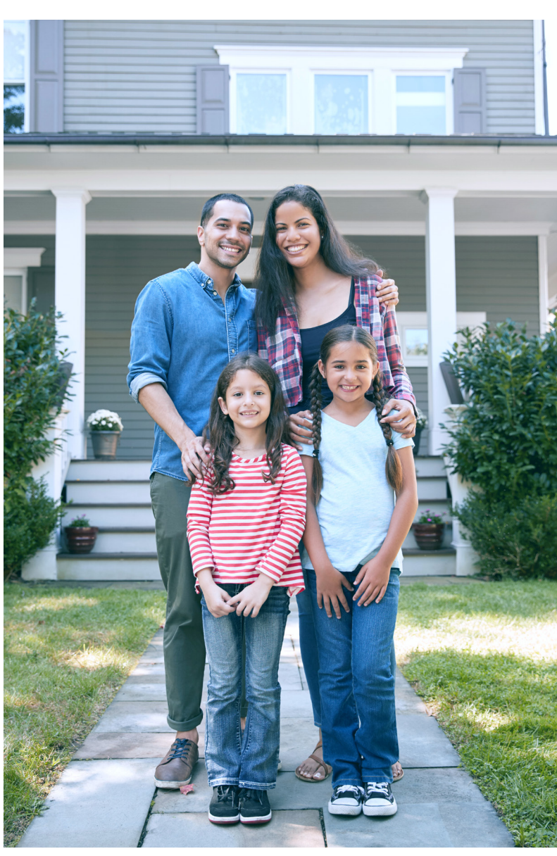
Oregon Home Energy Loans Project Workflow 4